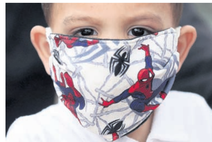
A boy wears a Spiderman face mask amid the spread of the new coronavirus in Bogota, Colombia, Thursday, April 30, 2020.

"Shoes would be a good comparison," he said. "You can live without them, but using them provides benefits, and they've evolved in all kinds of sizes, styles, colors and materials." □